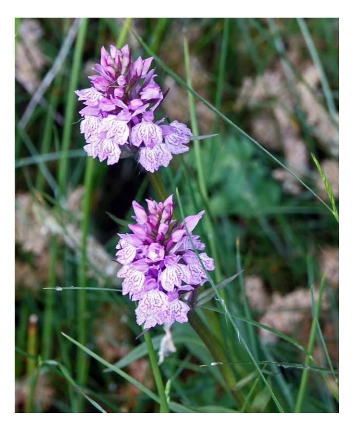
Early marsh orchid