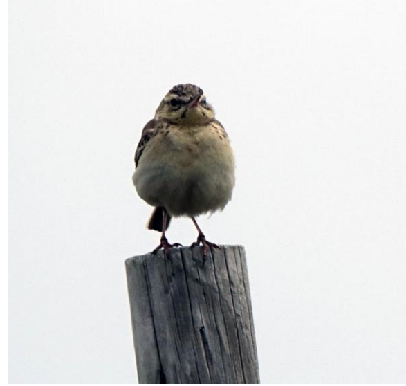
Ortolan bunting Tawny pipit Next was coffee in Candelario and a look at the Swifts, both Pallid and Common, winging by in the square.