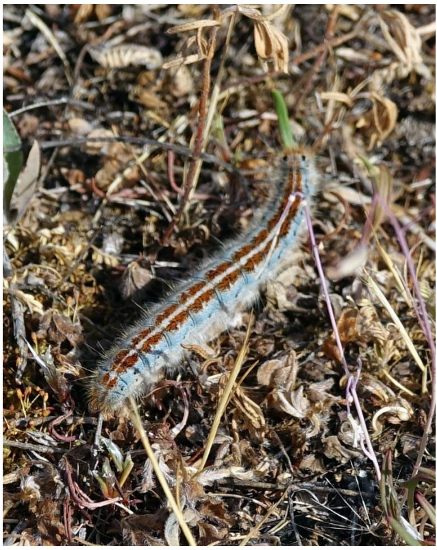
Ground lackey moth caterpillar

On the ground we found a Ground lackey moth caterpillar, Malacosoma castrensis , some tiny yellow cistus Halimium lasianthum subsp. alyssoides , Stork's bill Erodium ciconium and a pair of mating Red-legged grasshoppers, Chorthippus binotatus .