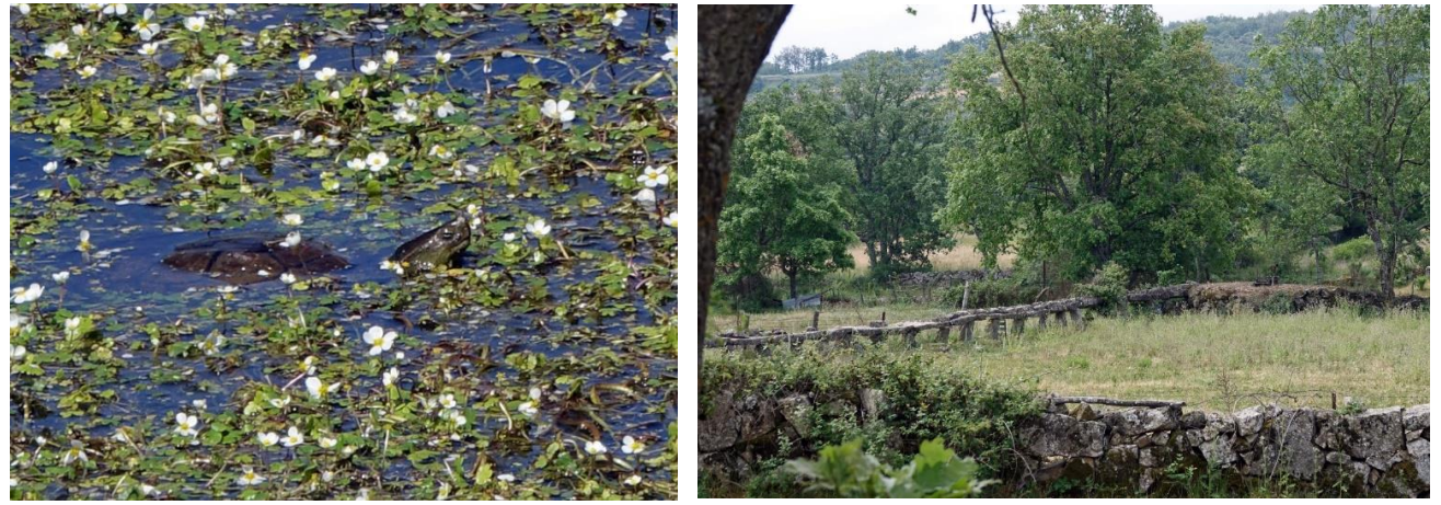
Spanish pond terrapin

From the old bridge we spotted Iberian water frog, European and Spanish pond terrapin.