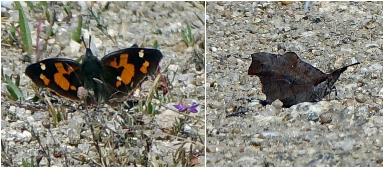
Nettle tree butterfly

After lunch we went to the Alagon valley where we stopped to look at Nettle tree butterfly, Large tortoiseshell, Holly blue and an Essex skipper, and the Beefly Villa hottentotta .