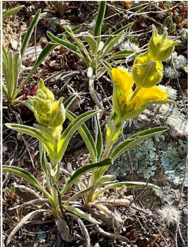
Hare's ear