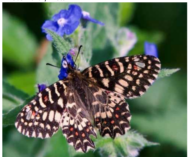
Spanish festoon