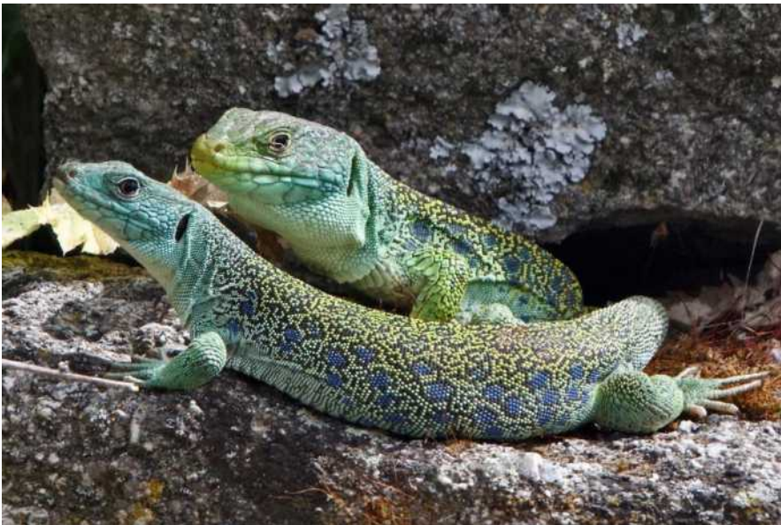
Ocelated lizards

As we were about to get in our vehicles, we spotted an Ocelated lizard peeping out between some rocks. We waited quietly and a second lizard, the male, came out as if to see what was goin on. WE watched them for 15 minutes: the female climbed over a stone and disappeared. Only to reappear a little later from the same hole. She had obviously used the back door!