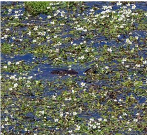
Spanish pond terrapin