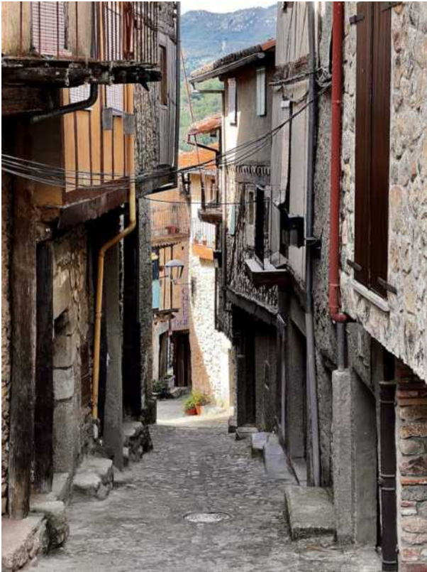
Street in Miranda del Castañar