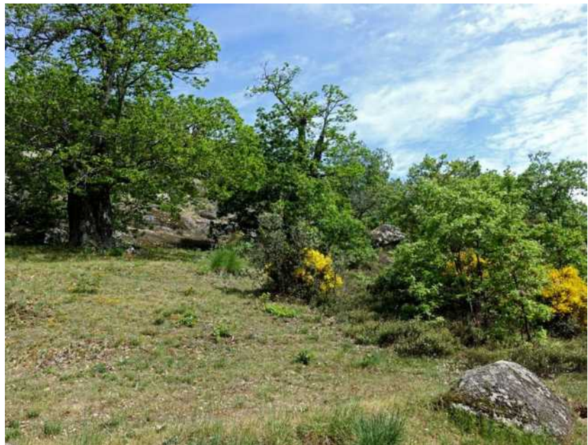
Chestnut grove Neila de san Miguel