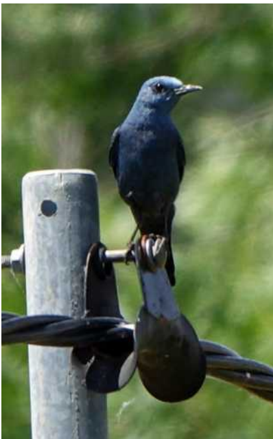
Blue Rock thrush