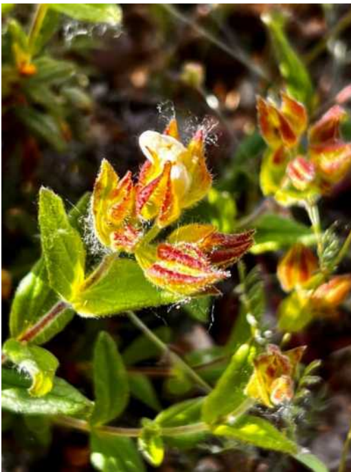
Cistus salvifolius

On our way back we stopped at a layby in front of a slate cliff to look for the delicate blue Daisy-leaved toadflax Anarrhinum bellidifolium ... and there was: just one plant! There was Sage-leaved Rock-rose Cistus salvifolius in bud, Blue pimpernel Lysimachia monelli , Mountain sandwort Arenaria montana , and some very red-leaved Hare's-foot clover Trifolium arvense . There was also a very attractive Broom heather in flower Erica scoparia .