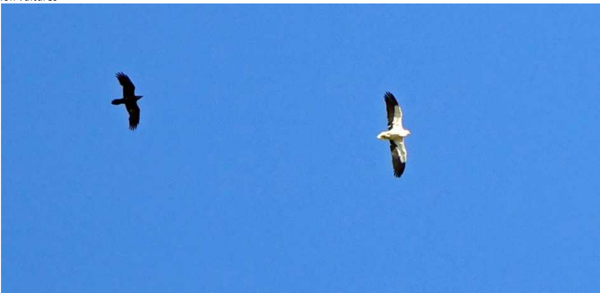
Raven mobbing Egyptian vulture