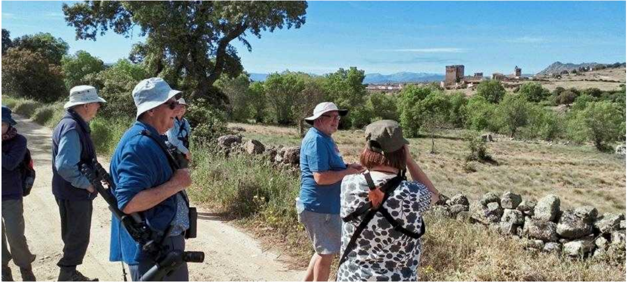
Honeyguiders with Puente del Congosto in the background

We started off along a track parallel to the River Tormes, a mixture of Mediterranean scrub with Dehesa and pasture to one side and dry river valley to the other.