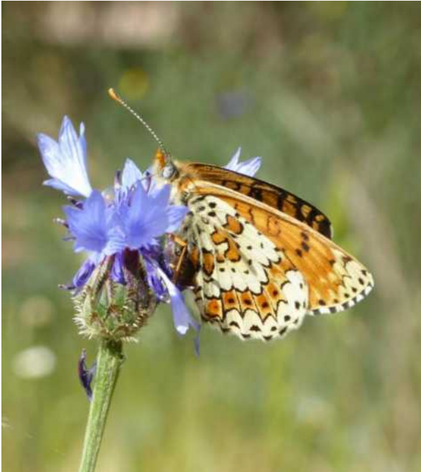
Glanville fritillary