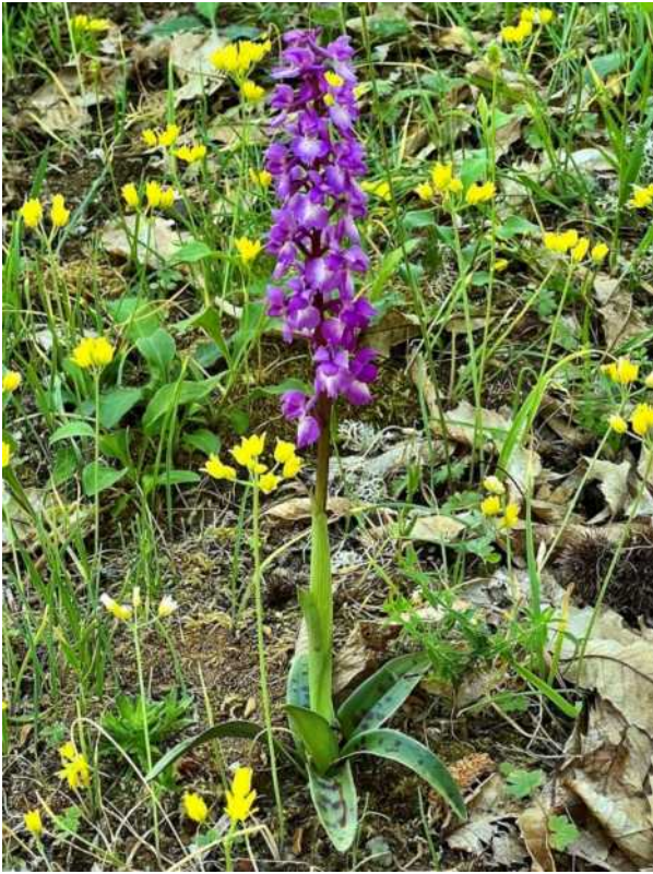
Orchis mascula

calcareo : endemic Three birds toadflax Linaria triornithophora , Wild peony and Columbine Aquilegia vulgaris possibly subspecies dichroa .