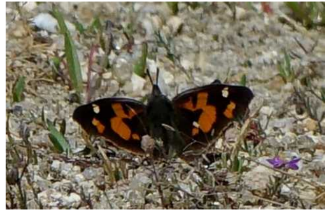
Nettle-tree butterfly, open and with wings folded

To top the day, on our way back on the road we spotted a Black stork by a pond near some woods. As we stopped at the side of the road, it flew to the nearby trees and stood watching us as we watched it, before flying to a lagoon nearby.