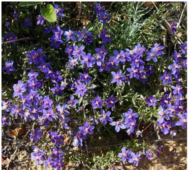
Blue pimpernel