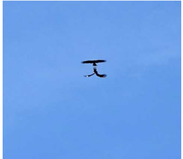
Red kite below, black kite above

We then continued by vehicle, stopping to see the Bee-eaters up to their antics around their colony.