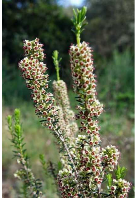
Erica scoparia

A lovely Lang's short-tailed blue butterfly was spotted on Spanish lavender by Helen.