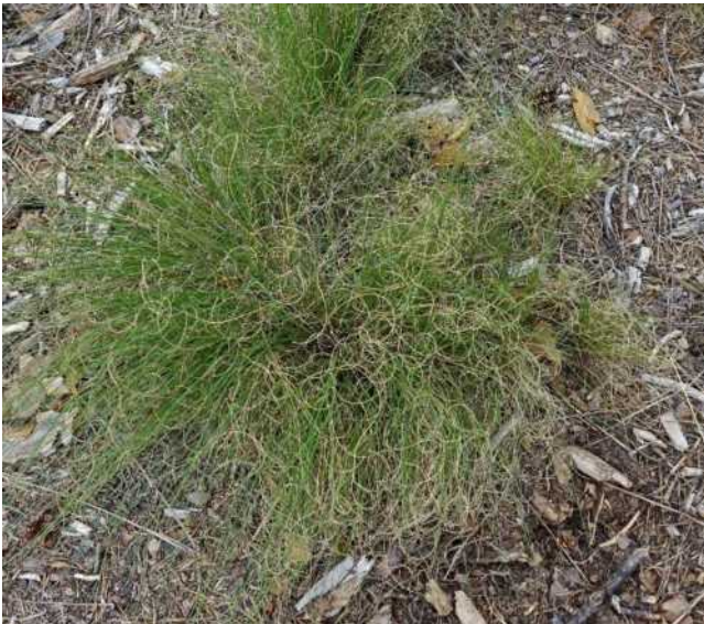
Unidentified curly grass

There were Coal tits calling Cheryl spotted a Tree pipit.