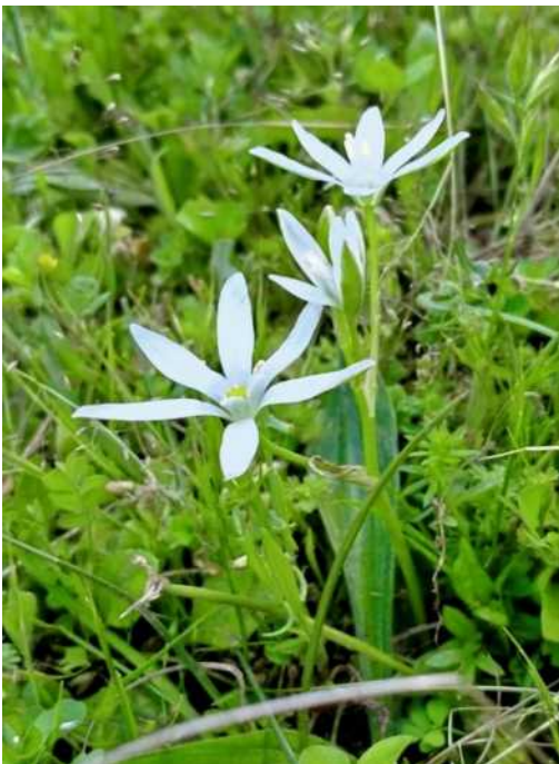
Star of Bethlehem