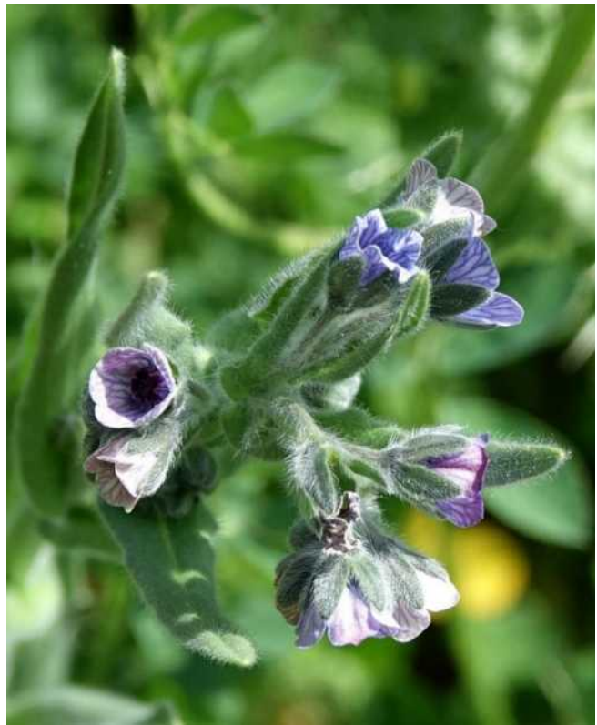
Blue hound's tongue