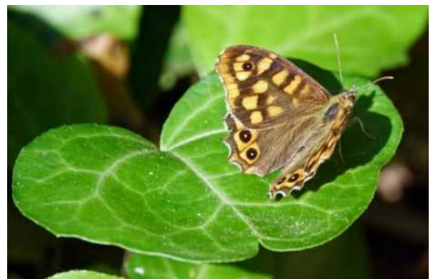
Southern Speckled wood

From here we drove up to the square at Miranda and had a wander around the village, with its narrow streets, half-timbered houses and walls overlooking the Sierra.