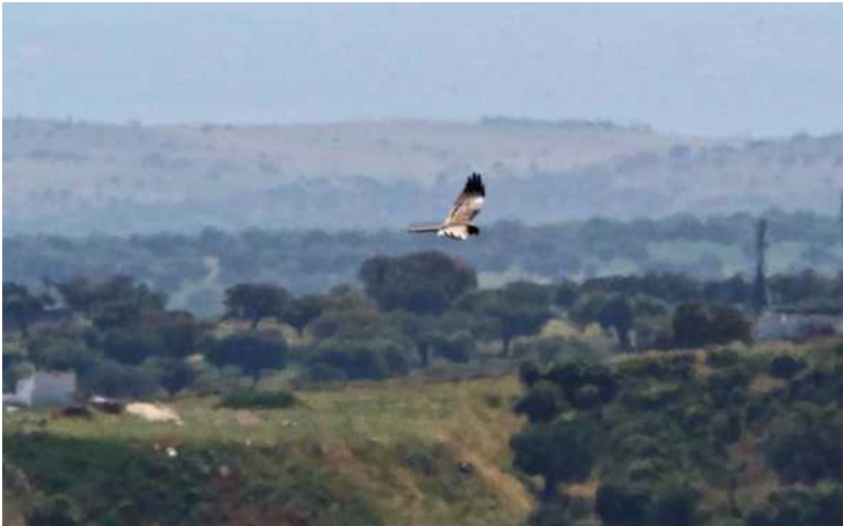
Montagu's harrier