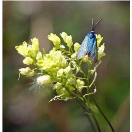
Buckler mustard with Forester moth