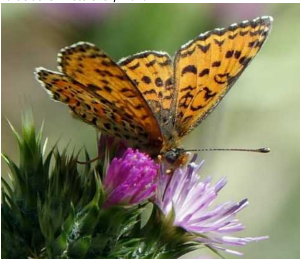
Lesser Spotted fritillary