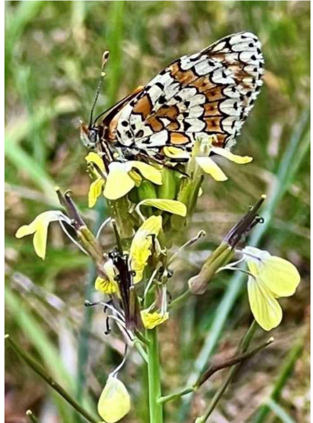
Glanville fritillary