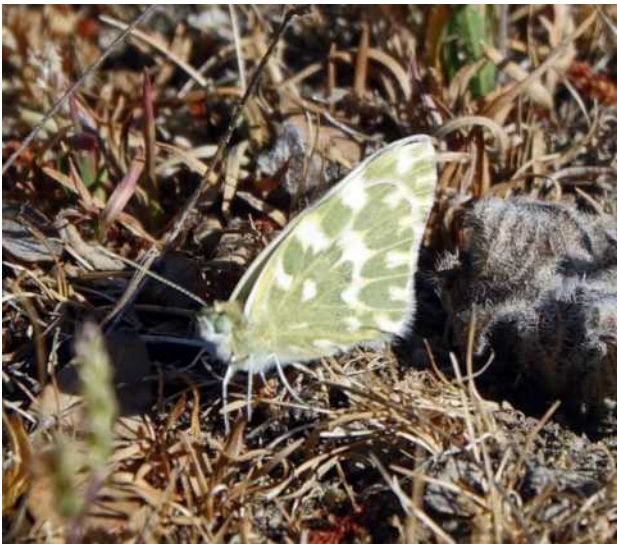
Bath white

There was Clouded yellow, as well as plenty of white butterflies: Small white, Western dappled white and Bath white.