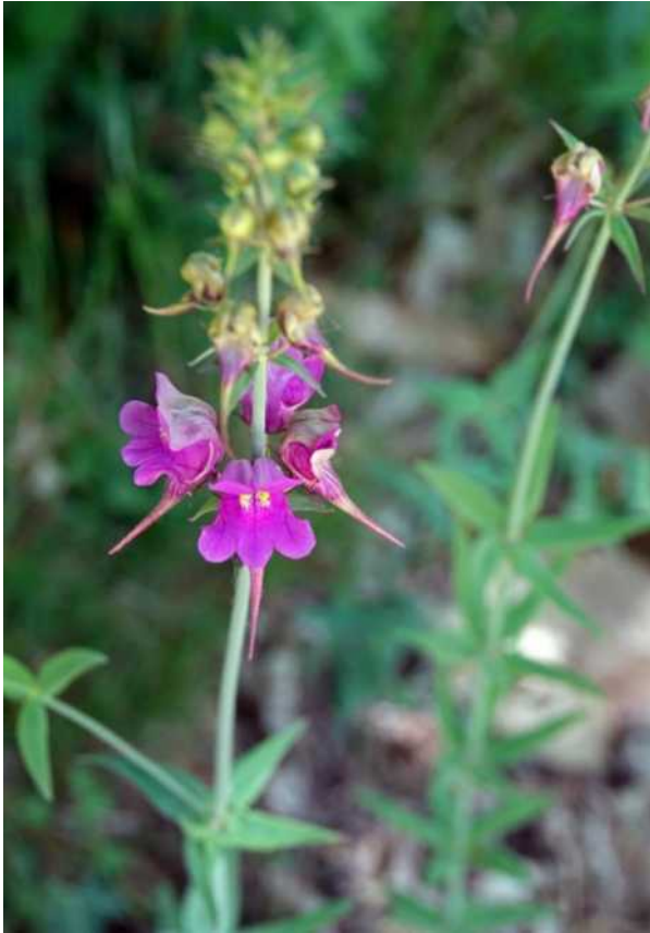
Three birds toadflax