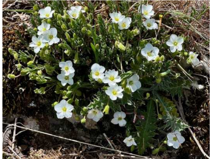
Mountain sandwort