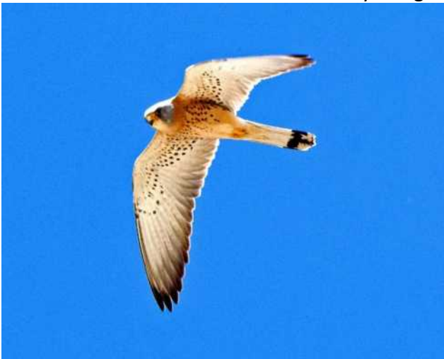
Lesser Kestrel

We watched Lesser kestrel in the nearby village of Herrezuelo where they use nesting boxes.