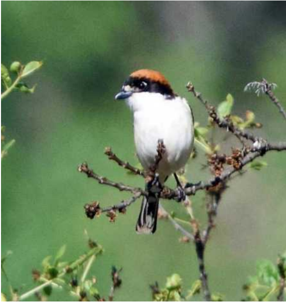
Woodchat shrike