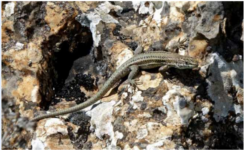
Iberian wall lizard