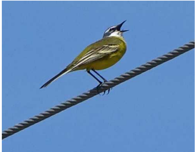
Iberian Yellow wagtail if you look closely you can see its tongue as it sings

In the distance a male Hen harrier got into an aerial scrap with a female marsh harrier.