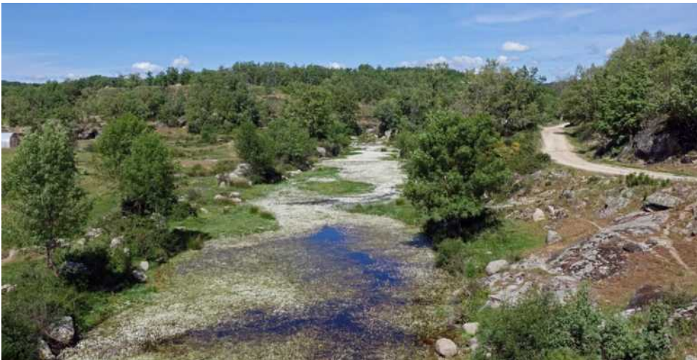
View from the bridge Sangusin valley

We next moved on to the Sangusin river valley, and stopped on the medieval bridge to watch Spanish pond terrapin Mauremys leprosa and Iberian Green frog Rana perezi , difficult to spot amongst the dense flowers of the Water crow-foot, probably Ranunculus penicillatus .