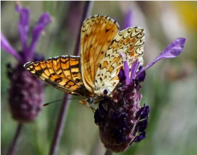
Knapweed fritillary

Our first stop was on a platform overlooking the eastern side of the Sierra de Francia, above San Esteban, mainly Mediterranean scrub and oak forest beyond. An ancient wine press carved from a granite boulder was the main objective, but there were Golden oriole, Woodchat shrike, Iberian magpies and many butterflies: Knapweed and Queen of Spain fritillary, Bath white, Brown argus, Scarce swallowtail and a lovely species of Purple barred yellow moth: Lythria sanguinaria .