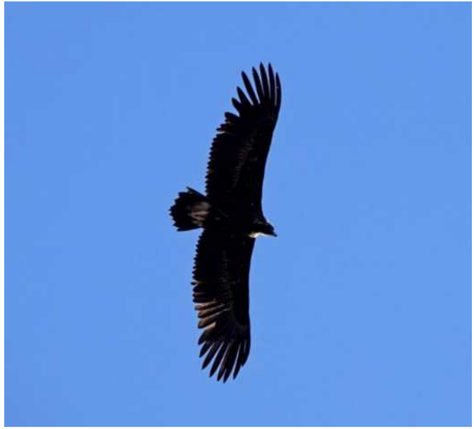
Black vulture

There was Clouded yellow, as well as plenty of white butterflies: Small white, Western dappled white and Bath white.