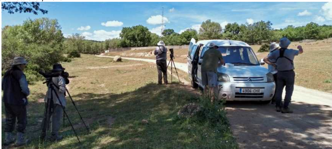
Watching bee-eaters from a safe distance