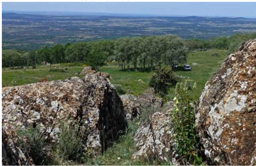
View to the picnic area and plains below

Goshawk was seen in the forest on the way back. We stopped briefly for more butterflies by a stream and meadow near Monleón, where we saw Lang's short-tailed, Glanville fritillary, Sooty copper Lycaena tityrus bleusi , and two Lesser spotted fritillaries mating.