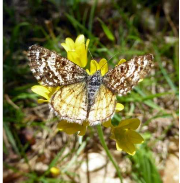
Isturgia famula

We then drove up on to the mountain for a picnic lunch under the shade of a stand of Pyrenean oak.