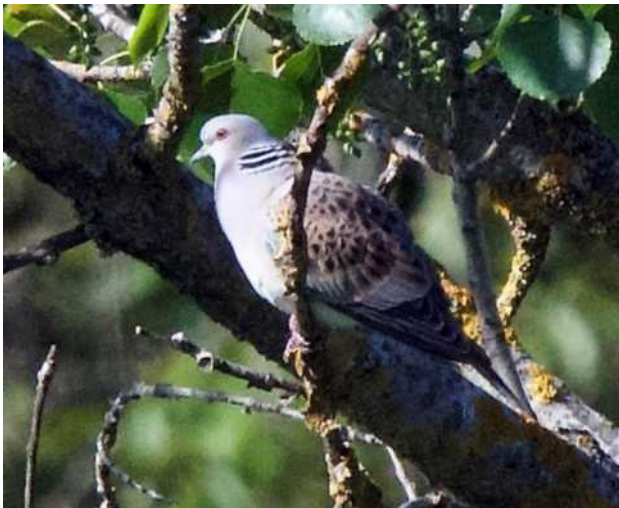
Turtle dove

Below the walls was a purring Turtle dove, in the sky a Black vulture. We wandered through the Coria gate, down a path between the walls and steep banks over the river Alagon, covered in wild flowers which in turn hosted many butterflies including Spanish festoon Zerynthia rumina , Niobe Argynnis Niobe , and Queen of Spain fritillaries, and one which we took to be Spotted fritillary, but on closer inspection is Lesser Spotted fritillary Melitaea trivia ignasti .