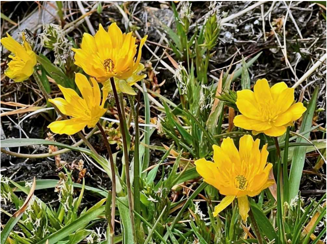
Ranunculus abnormis

Further up the mountain we found some Yellow flowered ranunculus Ranunculus abnormis , endemic to the Central system.