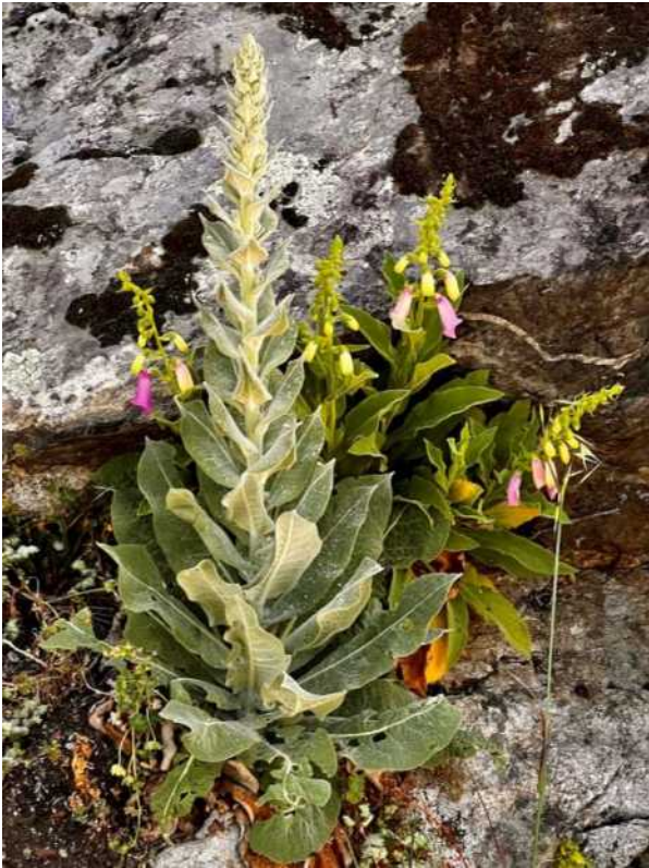
Foxglove and Hoary Mullein

There were endemic Foxgloves Digitalis thapsi , Blue pimpernel, Cheesemaker thistle Carduus carpetanus , Blue hounds' tongue Cynoglossum creticum , Salad burnet Sanguisorba minor and the tiny –flowered endemic Scrophularia bourgaeana . The Hoary mullein Verbascum pulverulentum was also about to flower.