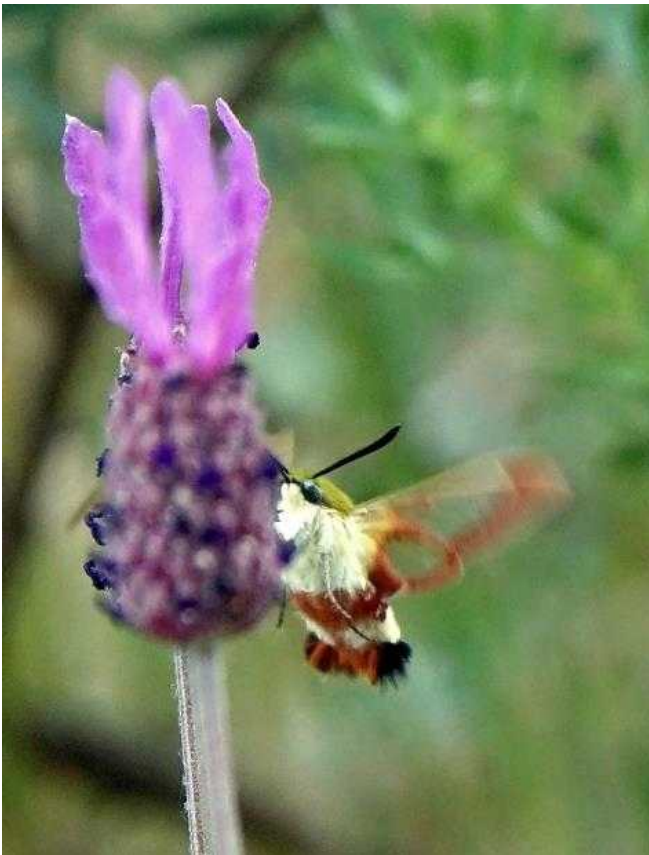
Broad-bordered bee hawk moth