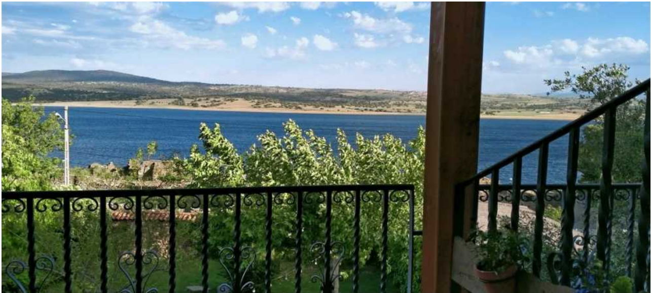
View from the hotel

We met up with most of the group at Madrid airport just after midday, and decided to drive straight to Hotel Rural Salvatierra , in time for a late lunch. Through the French windows of the dining room we could see a Nightingale and Spotless starlings, who have settled for hotel life. After lunch Alfonso and I picked up Linda and Ron, who had come a few days earlier, from the bus station at Guijuelo, and, after a short rest, we had a wander around the village, consisting of a few elegant buildings amongst ruins and slate walls with a mix of ruderal plants and wild flowers growing everywhere in between.