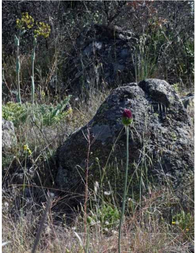
Drumstick allium with Villous deadly carrot top left