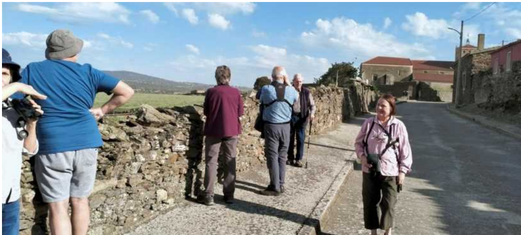
Around Salvatierra de Tormes

We met up with most of the group at Madrid airport just after midday, and decided to drive straight to Hotel Rural Salvatierra , in time for a late lunch. Through the French windows of the dining room we could see a Nightingale and Spotless starlings, who have settled for hotel life. After lunch Alfonso and I picked up Linda and Ron, who had come a few days earlier, from the bus station at Guijuelo, and, after a short rest, we had a wander around the village, consisting of a few elegant buildings amongst ruins and slate walls with a mix of ruderal plants and wild flowers growing everywhere in between.