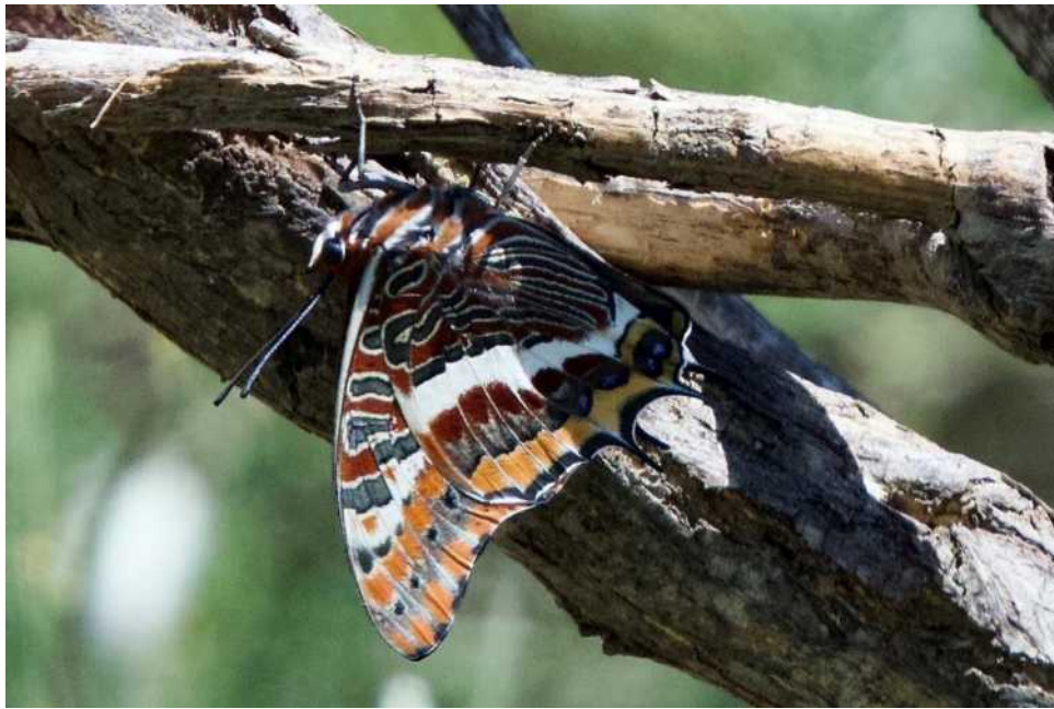
Two-tailed pasha