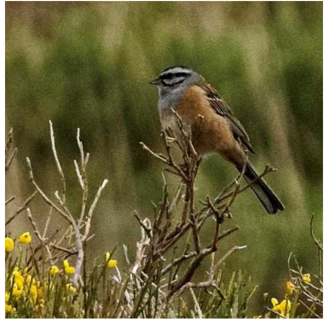
Rock bunting

Further up the mountain we found some Yellow flowered ranunculus Ranunculus abnormis , endemic to the Central system.