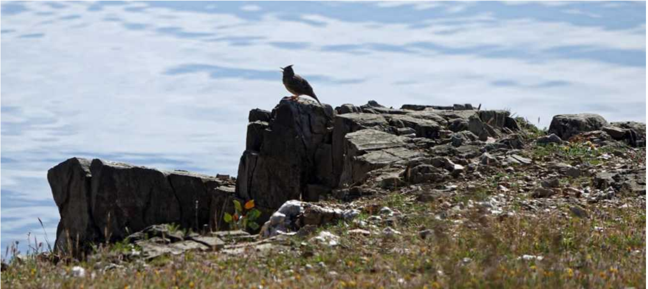
Crested lark singing at Sta Teresa Reservoir

As we were leaving we stopped again to watch a large group of Griffon vultures, and amongst them we spotted a pair of Egyptian vulture being mobbed by raven.