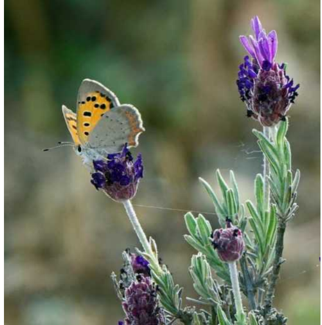
Another Small copper