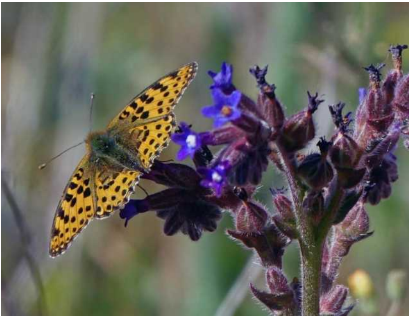
Queen of Spain fritillary