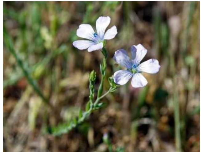
Rampion bellflower, Umbrella milkwort (above right) and Pale flax

After coffee at the hotel we spent the rest of the day in Navahombela, with a picnic style lunch in the shade at La Pedriza bar in La Tala nearby. Along a track through a valley between fields and dehesa, birdsong everywhere, we could hear Golden oriole long before spotting it, flying between trees. Meanwhile when not drowned out by Nightingale, Cuckoo, Great tit and Blackcap, we heard the soft purring of the Turtle dove. After searching and almost giving up, it suddenly flew to a cable in full sight as if to say, okay, you wanted to see me, so here I am. Gorgeous bird.