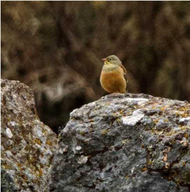
Ortolan bunting

We could hear Ortolan bunting singing in the distance, then one was spotted quite far, and another suddenly appeared on a rock, with food in its beak, followed by a Rock bunting a little further. The Ortolan disappeared to feed its young presumably, and came back later to sing.