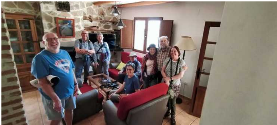
Honeyguiders inside Casa Rural El Gorgocil