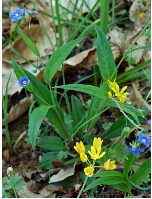
Omphalodes nitida and Yellow garlic