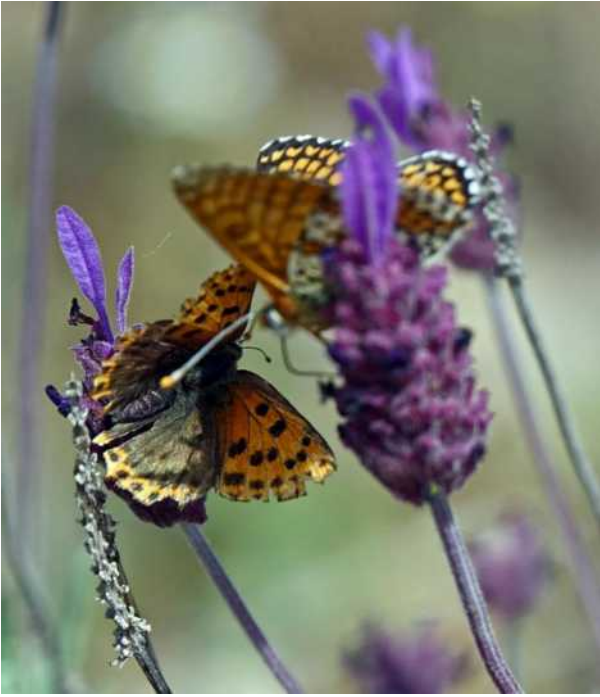
Sooty copper (left) with Glanville fritillary