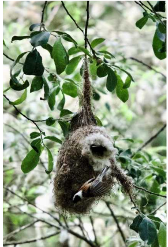
Penduline tit at nest

Later we headed for Berrocal de Salvatierra, (rescheduled from the first day) and on our way saw fourteen Red kite in a field. Berrocal was a total habitat contrast: an arid exposed slate landscape with scattered Spanish lavender, and predominantly Small copper butterflies.