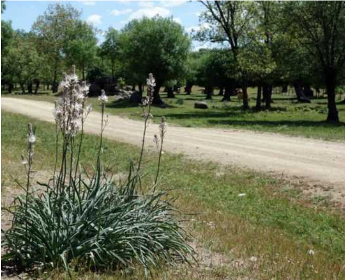
Asphodel and Ash dehesa

Further on in the open Ash dehesa woodland we found another Lythria moth Lythria purpurarea , various plants, and Helen found a Lavender (?) moth on the Spanish lavender Athroolopha pennigeraria . Despite the recent lack of rain there were Garden Star of Bethlehem Ornithogalum umbellatum , White asphodel Asphodelus albus and Euphorbia oxyphylla .