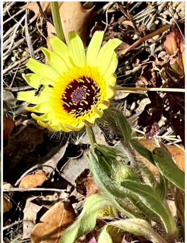
Hispidella hispanica

We saw Black and Red kite, Booted eagle, Griffon and a Black vulture which flew right over us clearly showing its feet, and Woodchat shrike, with the ever present Nightingale singing from the side-lines. A Subalpine warbler made an appearance at the edge of the path, clearly visible before darting for cover, and we also saw Rock bunting, Serin and Iberian magpie.