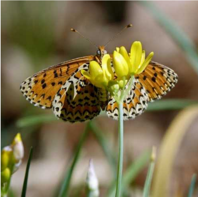
Lesser Spotted fritillary