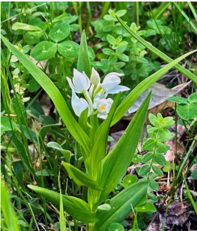
Narrow-leaved helleborine

There was a southern Speckled wood butterfly Pararge aegeria . There were Firecrest calling, and short-toed treecreeper, all virtually impossible to see in the dappled light of the forest.