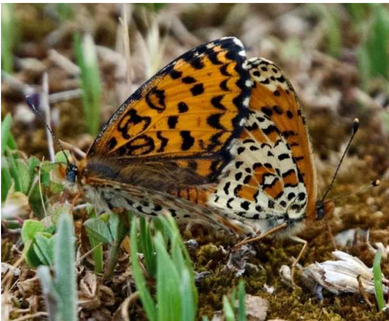
Lesser spotted fritillaries

Goshawk was seen in the forest on the way back. We stopped briefly for more butterflies by a stream and meadow near Monleón, where we saw Lang's short-tailed, Glanville fritillary, Sooty copper Lycaena tityrus bleusi , and two Lesser spotted fritillaries mating.