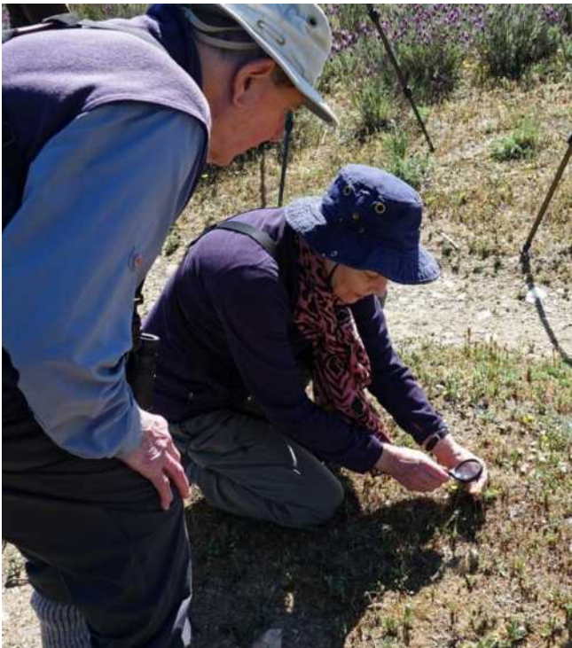
Looking at Helianthemum aegyptiacum