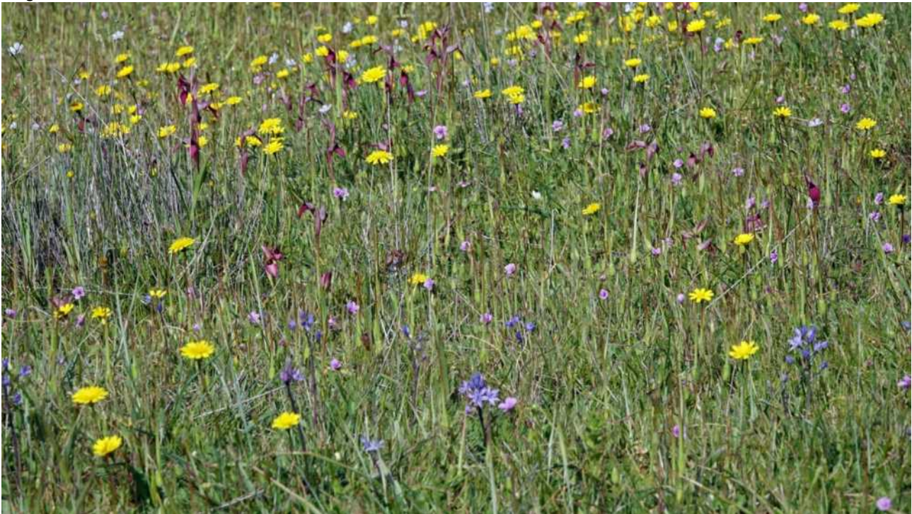
Squill, Tongue orchid, Pale flax, Stork's bill and Yellow composite

There was the Iberian Small heath Coenonympha pamphilus which has an extra tiny ocellus on its underside forewing and tiny ocelli on its underside hind.