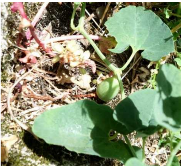
Fruit of Aristolochia paucinervis

We had a coffee at San Esteban, and wandered down towards the bridge over the river Alagon. Here we looked at the rather large oval fruit of the Aristolochia paucinervis , and the gall 'goat horns' of Pistachia terebinthus . There was also wild honesty growing near the river, more Dianthus lusitanus , some Bladder campion Silene vulgaris and a yellow broomrape, probably Orobanche alba .