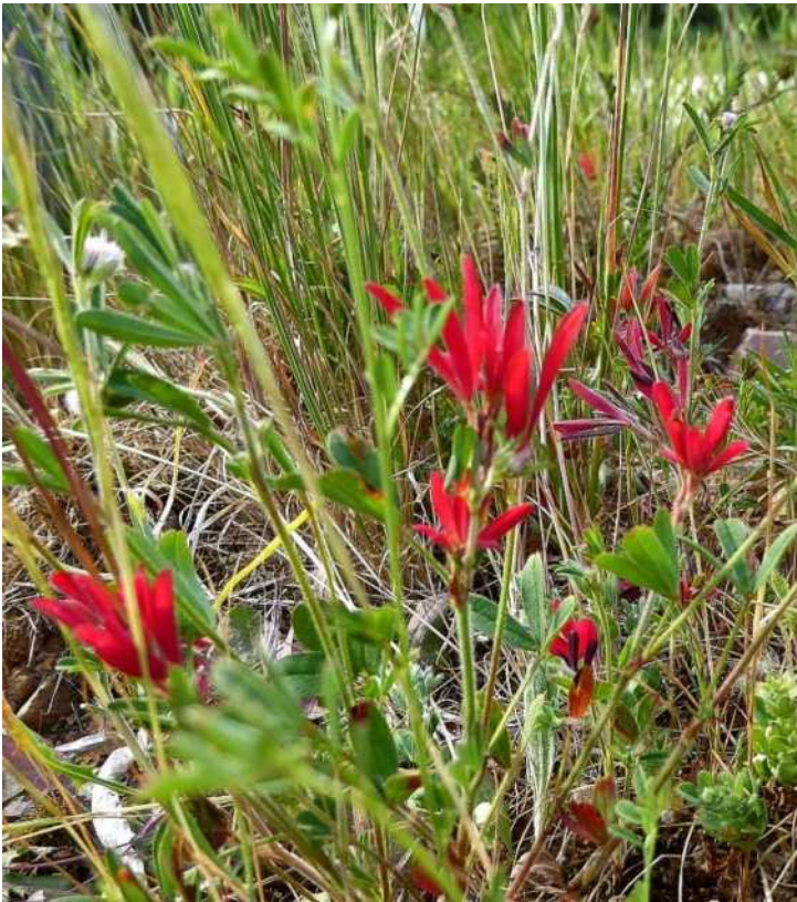
Hare's-foot clover