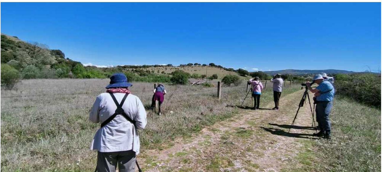
Looking at the Turtle dove

After coffee at the hotel we spent the rest of the day in Navahombela, with a picnic style lunch in the shade at La Pedriza bar in La Tala nearby. Along a track through a valley between fields and dehesa, birdsong everywhere, we could hear Golden oriole long before spotting it, flying between trees. Meanwhile when not drowned out by Nightingale, Cuckoo, Great tit and Blackcap, we heard the soft purring of the Turtle dove. After searching and almost giving up, it suddenly flew to a cable in full sight as if to say, okay, you wanted to see me, so here I am. Gorgeous bird.