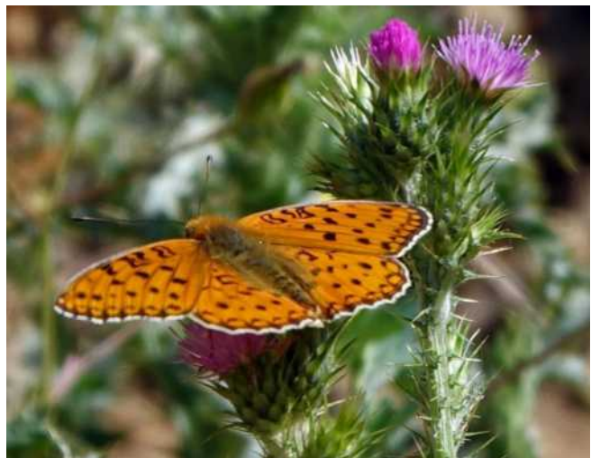
Niobe fritillary