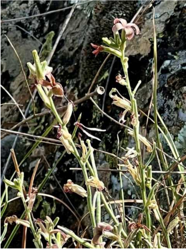
Sad stock Photo Tim Hunt