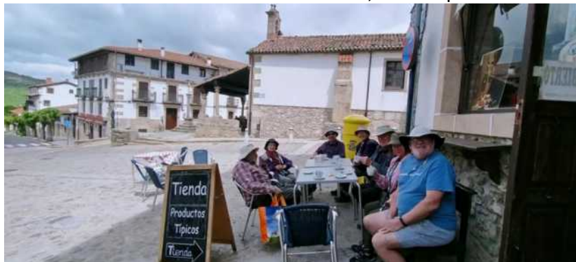
Coffee in Candelario

Candelario for coffee and a glimpse of Pallid swifts as they glided by amongst their cousins: almost impossible to follow with the binoculars let alone a camera, but the pallid look browner and chunkier.