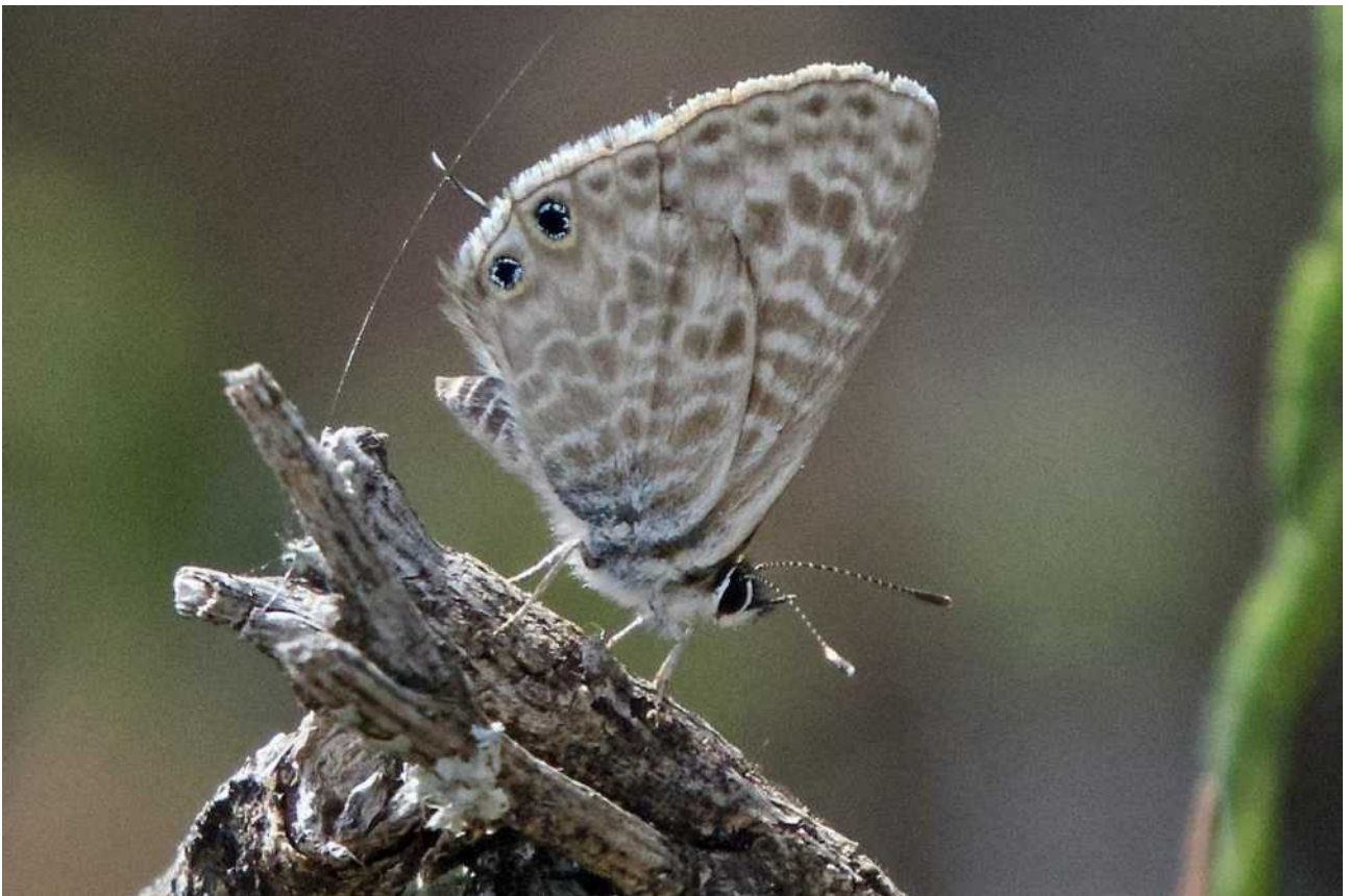
Lang's short-tailed blue

A lovely Lang's short-tailed blue butterfly was spotted on Spanish lavender by Helen.