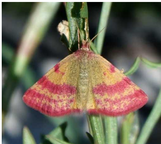
Purple barred yellow moth