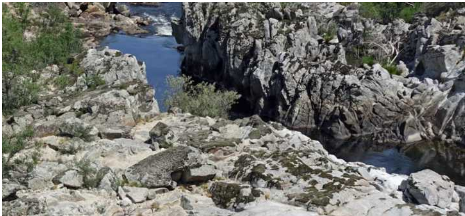
View from the bridge at Puente del Congosto

The Blue rock thrush was singing on a pole. Later we peered over the bridge, and saw him again: this was his territory and he was busy feeding his family.