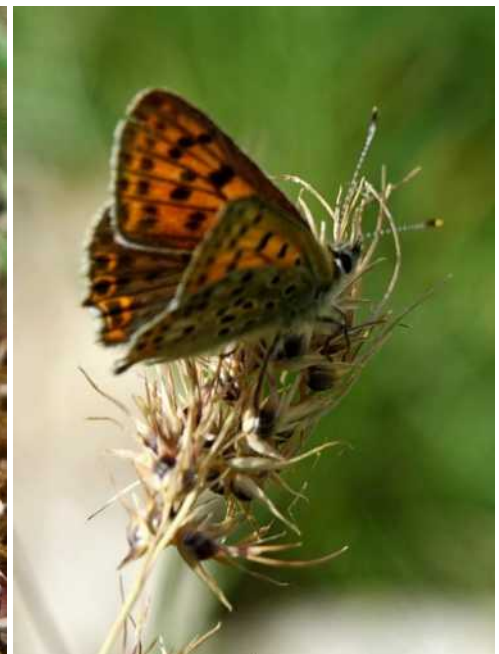
Sooty copper