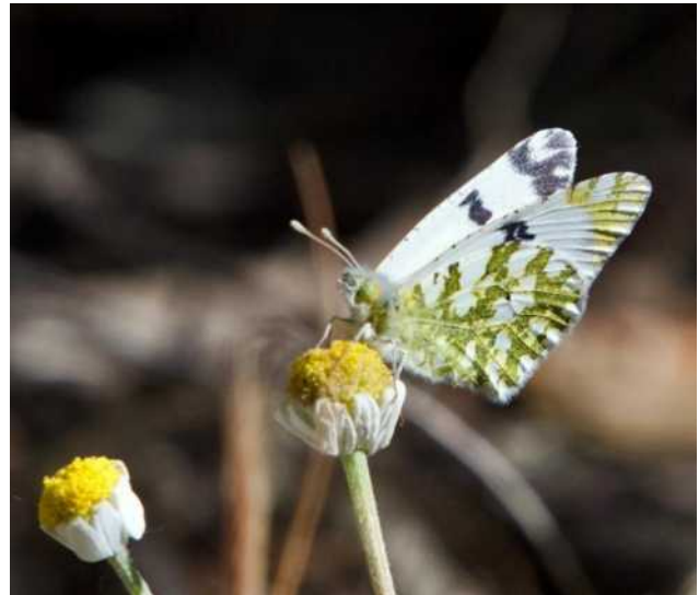
Western dappled white