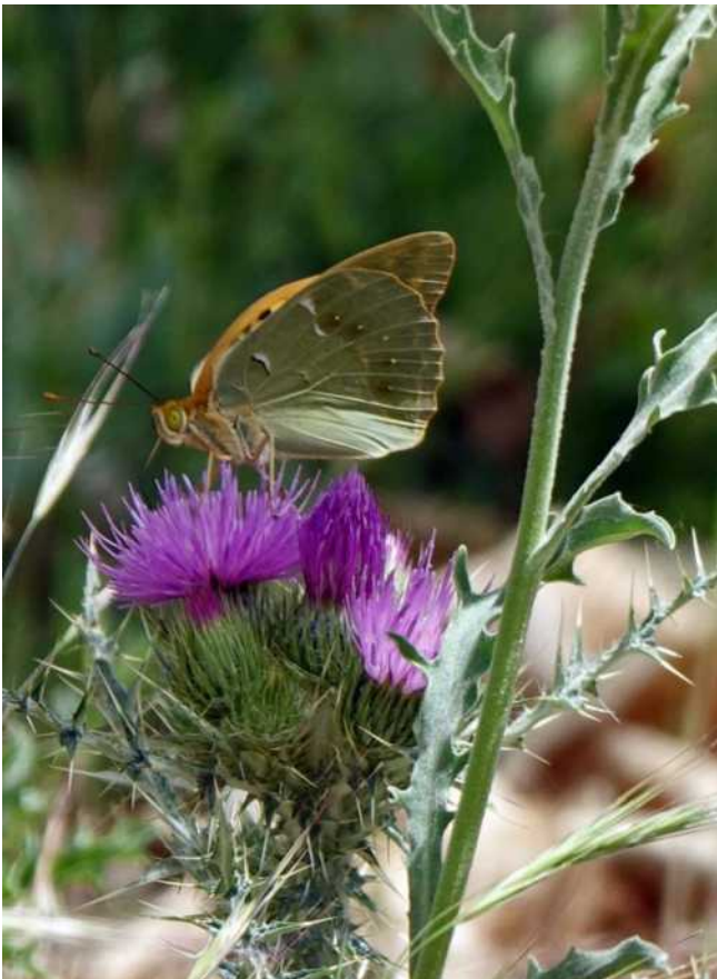
Cardinal on carduus carpetano

Here we saw Cardinal, Scarce swallow, Glanville, Western dappled white, Sooty copper, and Painted lady butterflies, a Broad-bodied chaser and the attractive Ascalaphid Libelloides hispanicus .