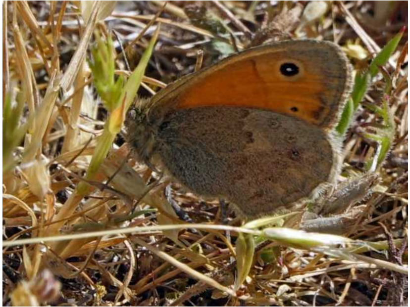
Iberian Small heath

We next moved on to the Sangusin river valley, and stopped on the medieval bridge to watch Spanish pond terrapin Mauremys leprosa and Iberian Green frog Rana perezi , difficult to spot amongst the dense flowers of the Water crow-foot, probably Ranunculus penicillatus .