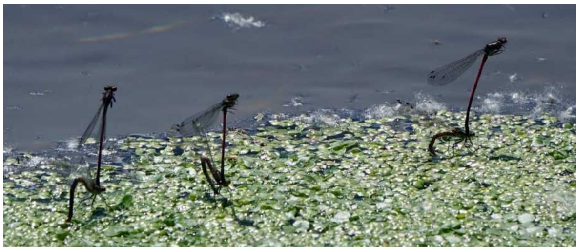
Large red damselfly

We picnicked by the river at Alba, deciding to skip a visit to the castle, choosing nature over culture. After lunch we walked between the river and a mill pond under the shade of Alder and Willow. On the pond surface were several Large red damselfly Pyrhosoma nymphula which were laying eggs, the male holding down the female so she could deposit the eggs under water.