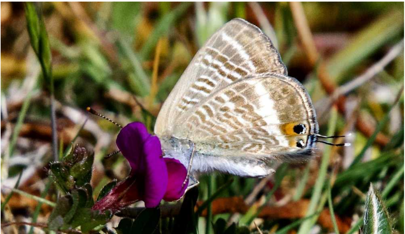
Long-tailed blue

Amongst the flowers were butterflies and moths: more Lesser spotted; a gorgeous Long-tailed blue Lampides boedticus (photographed) which, at the time we may have passed over as a Lang's short-tailed, Glanville fritillary Melitaea cinxia , Moroccan orange-tip and the moth Isturgia famula .