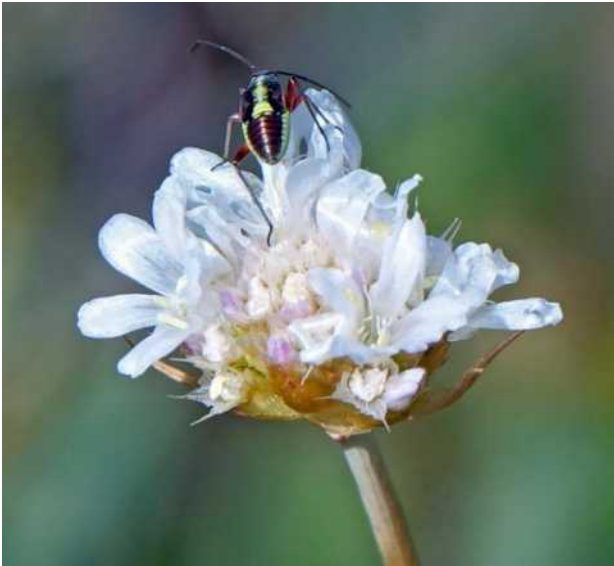
Unidentified insect on Armeria transmontana

Amongst trees and bushes were Woodchat shrike, Western Orphean warbler seen in retreat and a Golden oriole singing.